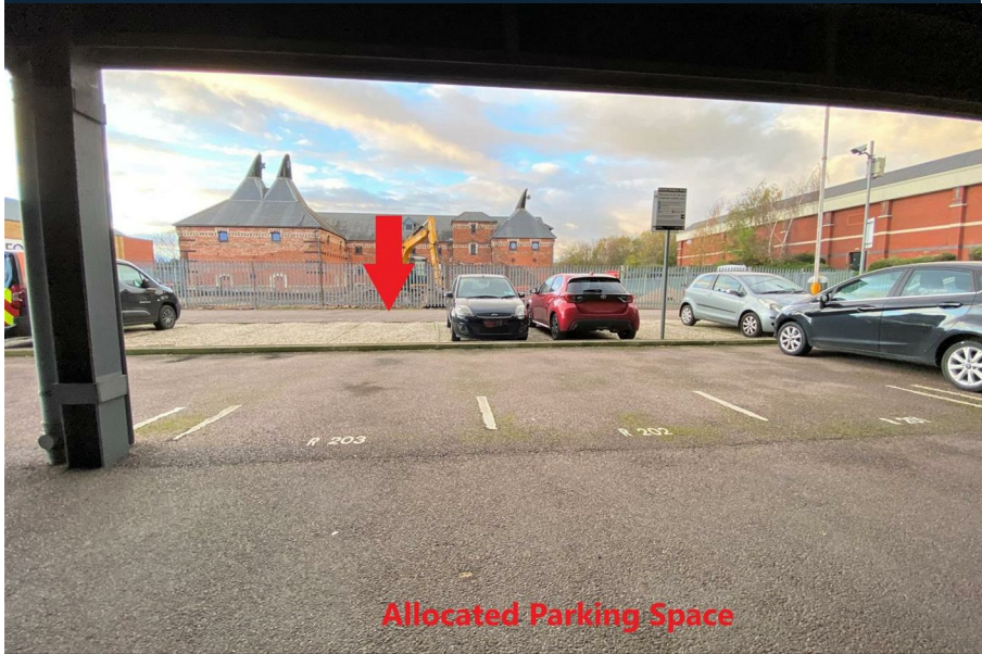
Allocated Parking Space

Externally, the apartment has an allocated parking space to the rear of the complex, via a secure barrier. Further benefits include double glazing throughout, a secure telecom entry system, efficient electric heating and a COMMUNAL LIFT to ensure ease and functionality. The complex also provides access to a popular coffee shop, clothing store and lies adjacent to a highly-renowned local gymnasium. Apartment 203 is CONVENIENTLY SITUATED for ease of access to Newark Castle and North Gate train stations, with a DIRECT LINK TO LONDON KINGS CROSS STATION, along with ease of access onto the A1 and A46. Internal viewings are highly advised, in order to gain a full sense of appreciation for this superbly enhanced, eye-catching home.