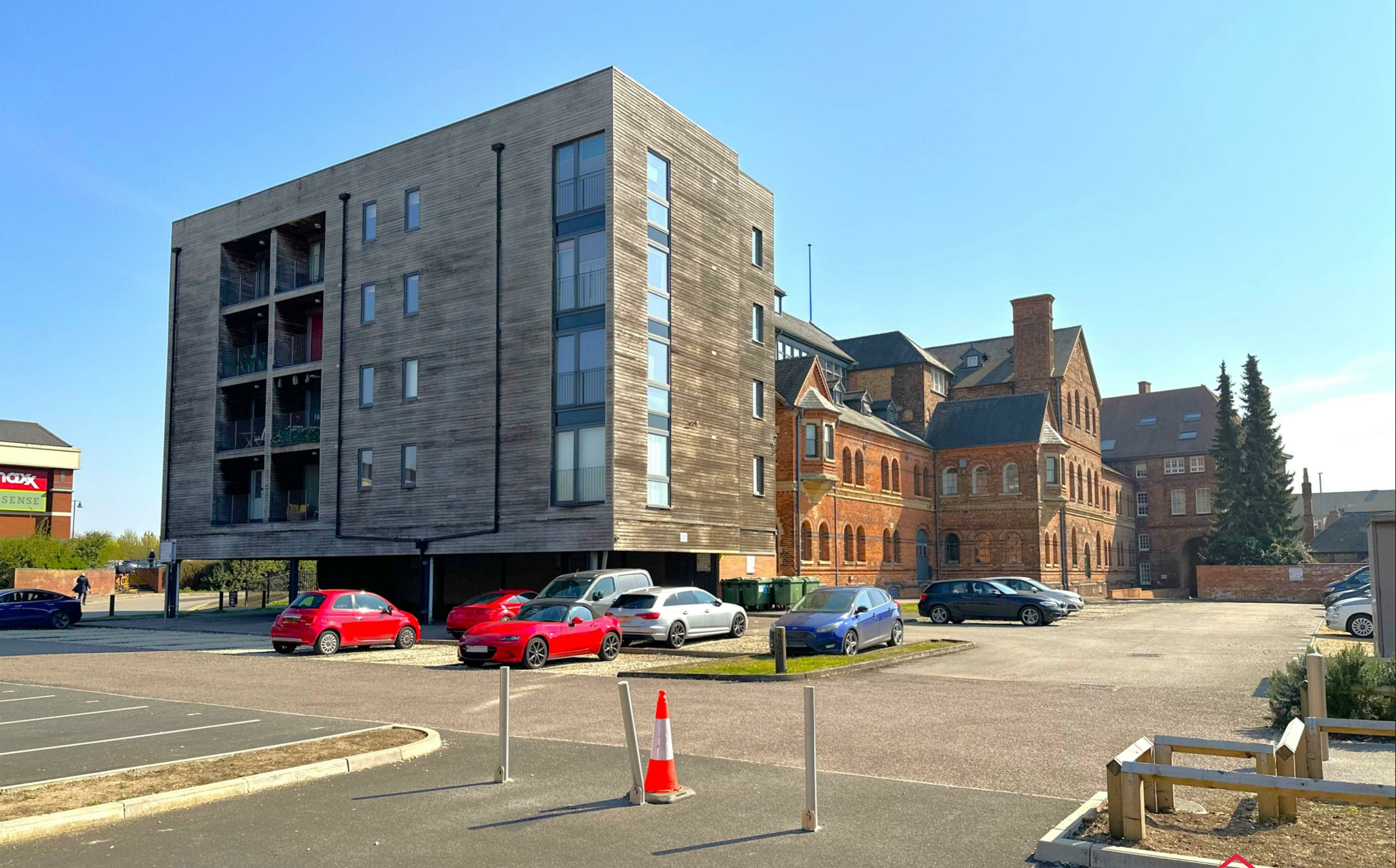
The Roundhead Building, Warwick Brewery, Newark